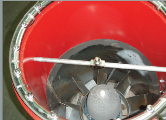
Sufag to PoleCat