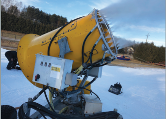
TurboCristal to Super PoleCat