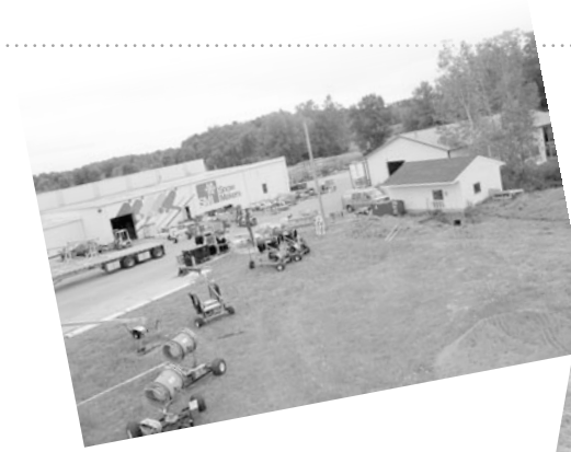
SMI research facility in Michigan

Semi-automatic may mean auto start, manual adjust, and manual stop. Another definition is manual start and manual stop with auto adjust. These snowguns may be standalone, in clusters or networked into a communication system.