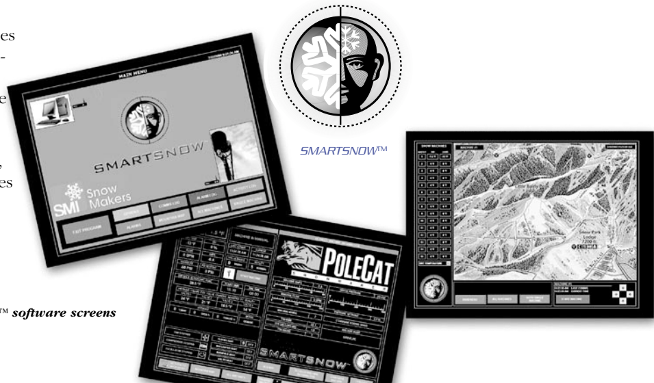
SmartSnow™ software screens

Call SMI today to learn more about the flexibility and simplicity of SMI software and controls.