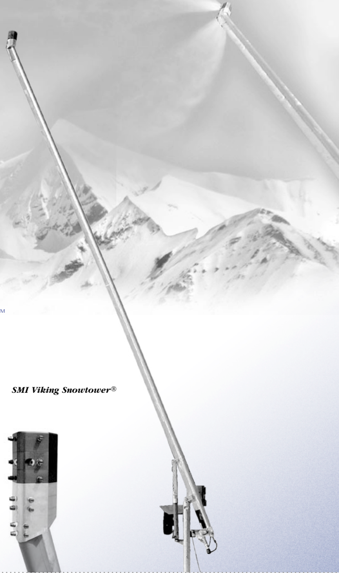
SMI Viking Snowtower®

VISIT OUR REDESIGNED WEBSITE AT WWW.SNOWMAKERS.COM